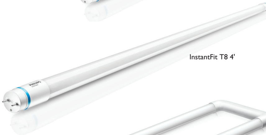
InstantFit T8 4'