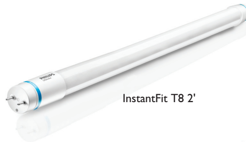
InstantFit T8 2'