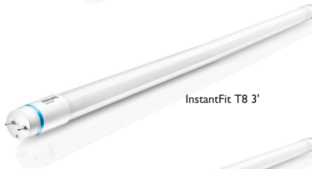
InstantFit T8 3'