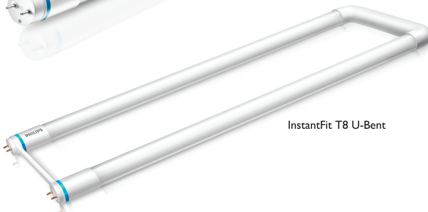
InstantFit T8 U-Bent